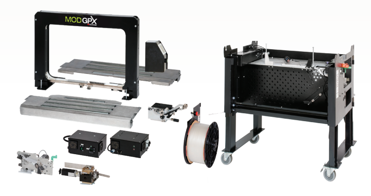
Semiautomatic model shown